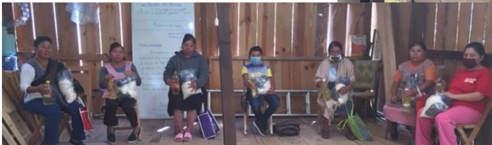
groceries we together, in Chicago and San Cristobal, have helped to deliver today.