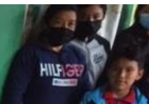
go (left); and delivery time, a few minutes ago, at the Church of San Benito de Nursia (below). About 800 meals will be provided by the