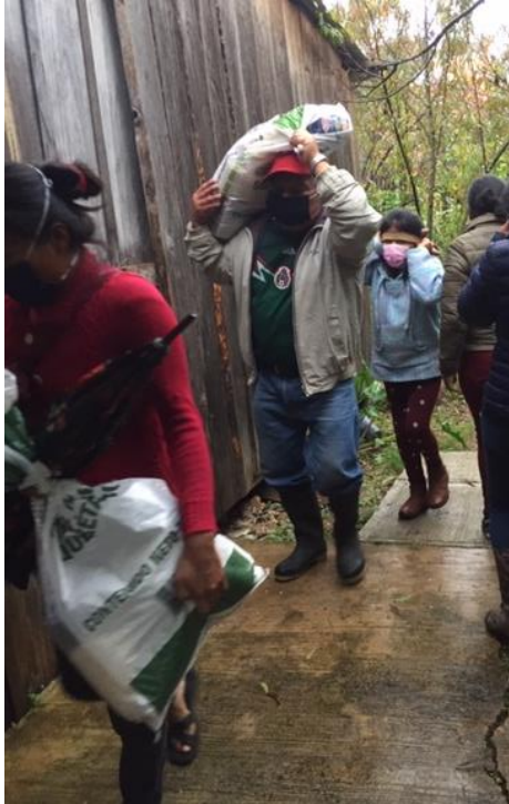
crew who broke the rice, beans, sugar and oil into 42 packets for pick-up this afternoon (right); groceries ready to